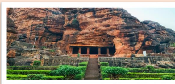
Badami caves, Aihole & Pattadakal