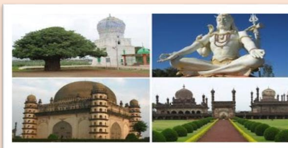
Golgumbaz, Shivagiri at Vijaypur